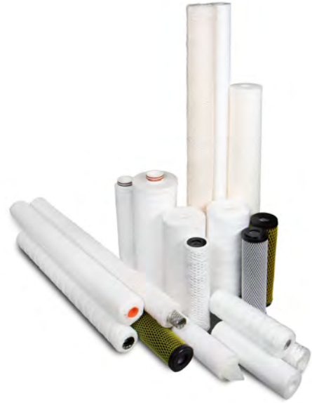
MWF manufactures a range of filter cartridges including string wound filters, melt blown filters, pleated cartridges, and carbon filters